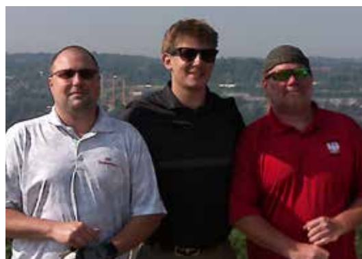
These golfers were among those who enjoyed Branch 89's golf outing in August.