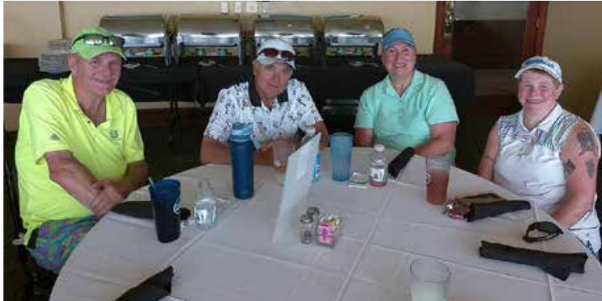
These golfers also enjoyed Branch 89's golf outing in August in Braddock, PA.