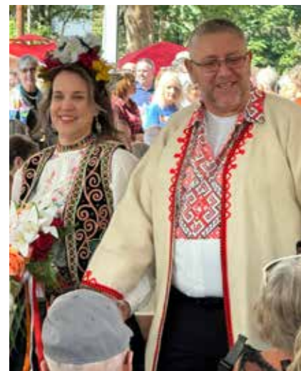
A couple in nearly century-old ethnic dress get married in a traditional Slavic wedding ceremony at the Johnstown Slavic Fest.