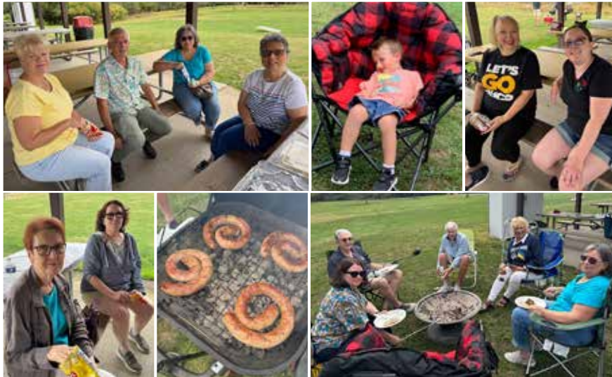
Members and friends of Branch 296 gathered Sept. 27 at Harrison Hills Park in Natrona Heights, PA, for the branch's annual bacon roast.