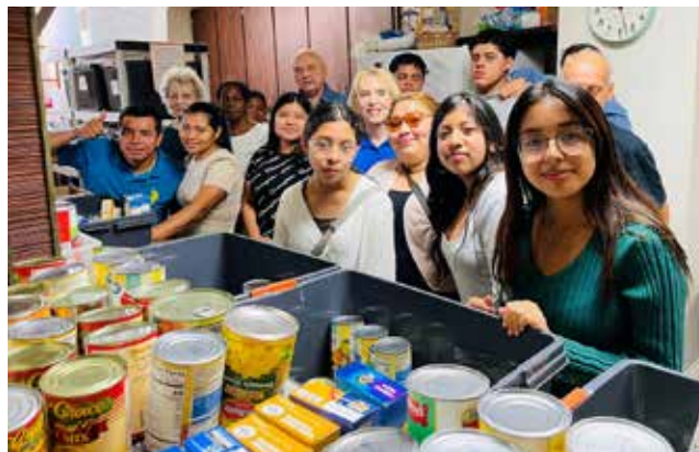
Members of Branch 19 and other volunteers from the community prepare food to be given away to residents in need in the New Brunswick area.

On Sept. 27, after another giveaway, the volunteers will be given a free lunch buffet funded by the branch.