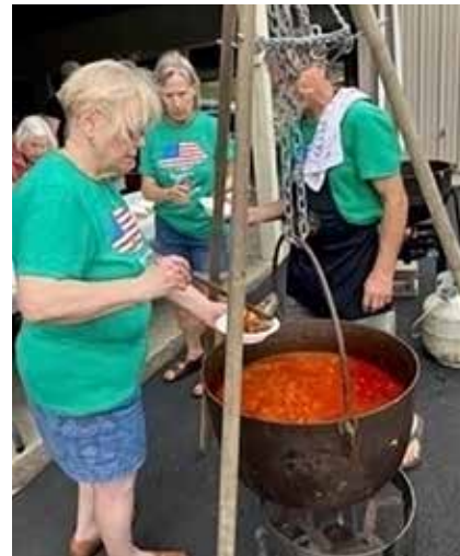
Members of the Magyar Club of Dayton prepare a kettle of gulyás for the club's annual Gulyás Fest.