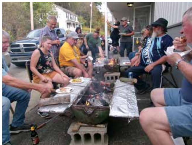
Members and friends of Branch 88 Rural Vally, PA enjoyed delicious food and warm fellowship during the branch's annual bacon roast held Sept. 21.