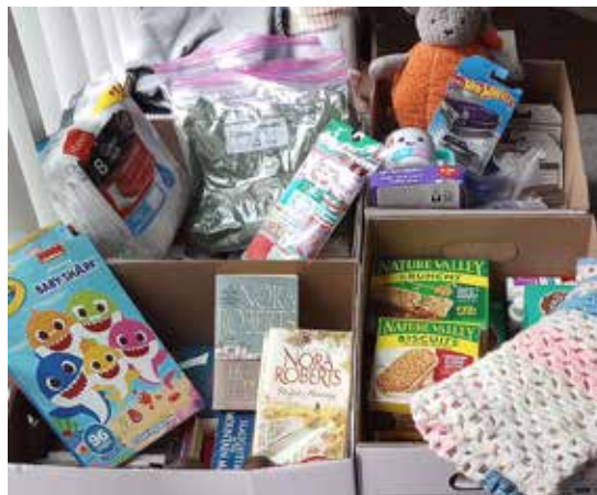
These items, donated by the members of Branch 1, were distributed to America's veterans and their families.

We wish everyone Season's Greetings, Merry Christmas and Happy New Year!