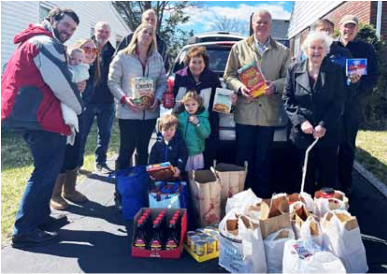
Members of Branch 51 prepare to deliver food and other items they and their fellow members donated for the branch's annual food drive.