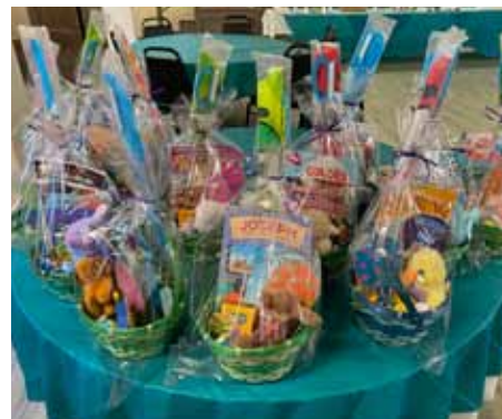
Pictured above and at left are items collected by Branch 1 in conjunction with the United Church of Christ in Bridgeport, CT. Some of the items were used to create Easter baskets for children while food and personal items were delivered to the Nourish Bridgeport food pantry.