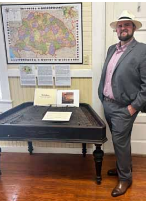
One of my favorite pieces from the collection at the Hungarian Settlement Historical Society Museum: an old cimbalom from Hungary.

While in Louisiana, I also had the privilege of visiting New Orleans. One of the oldest cities in the United States, New Orleans sits near the