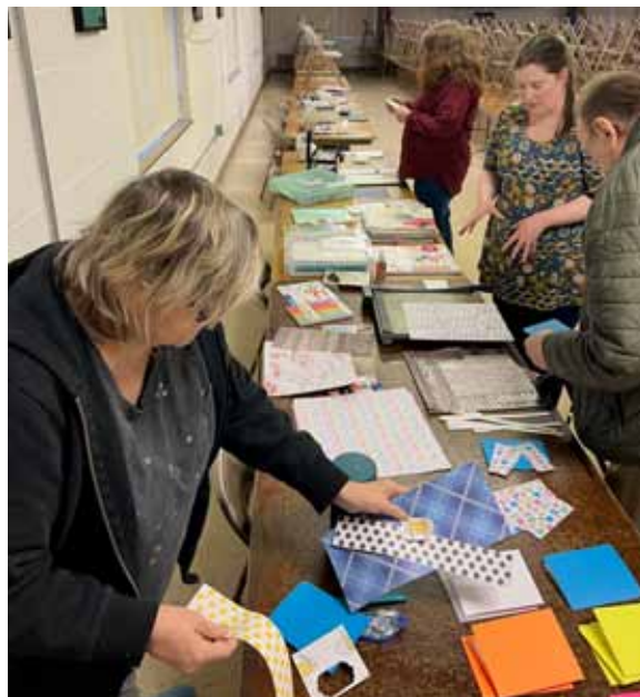
Members of Branch 226 create greeting cards for a program called Creative Kindness during a recent branch meeting. Members will gather again to create more cards during their next meeting on June 27.

Also May 29 is Memorial Day, the unofficial start to summer. Memorial Day honors service members who have died in military service to the nation. The holiday has roots dating back to the post-Civil War era, when citizens would informally place spring flower memorials on the graves of fallen soldiers. By the early 20th century, Memorial Day morphed into an occasion for more general expressions of memory, as people visited the graves of their deceased rela-