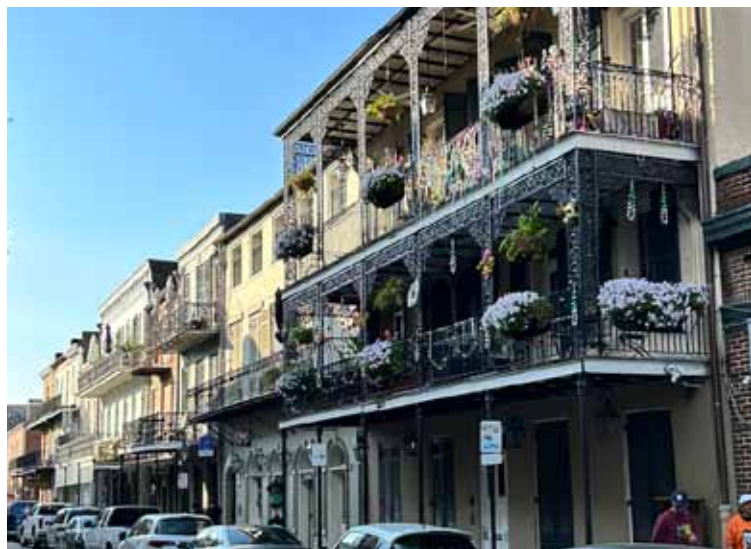
Bourbon Street is a welcoming place even in the daytime.

A visit to New Orleans isn't complete until you eat crawfish.