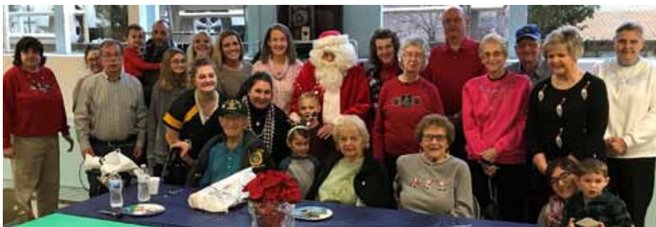
Members and friends of Branch 8 welcome Santa to the branch's family Christmas party.