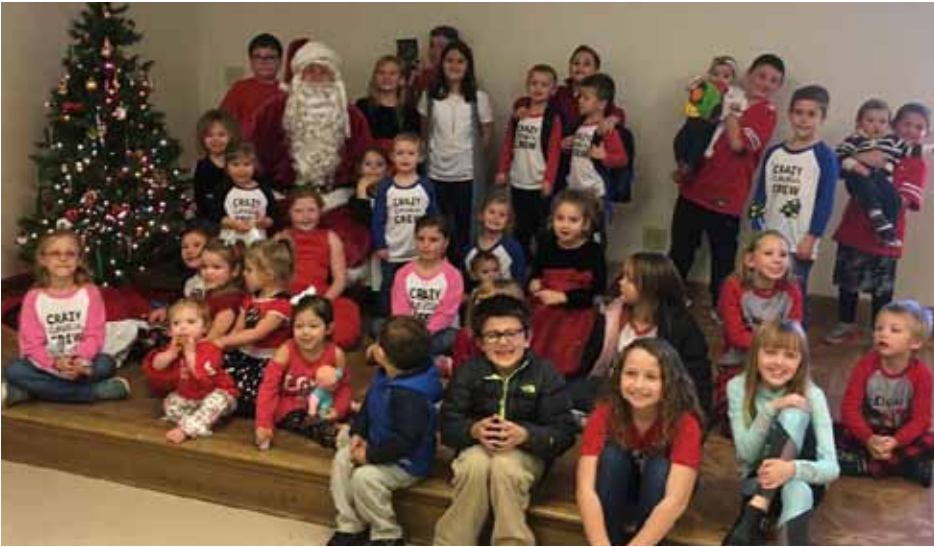
Santa also visited the young members attending Branch 129's annual Christmas party.