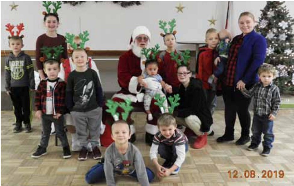
Santa Claus greets young members at the annual Branch 249 family Christmas party.

Office and Board. Everything looks good.