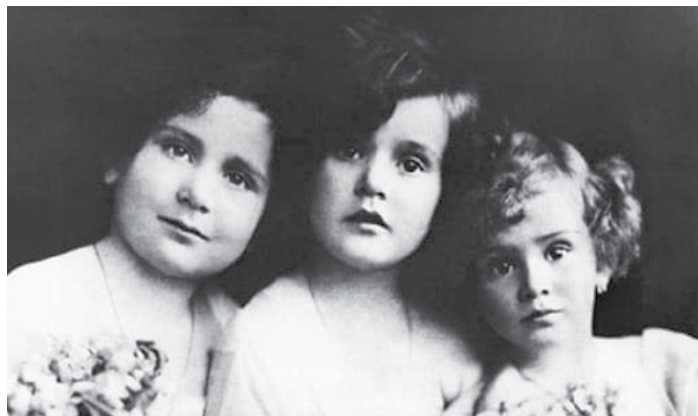
The Gabor sisters in the 1920s: (l-r) Magda, Zsa Zsa and Eva.

The Gabor family fortune--borne from Jolie's wildly successful jewelry business--enabled the sisters to attend the finest schools, take music lessons, frequent operas and concerts, study ballet, travel throughout Europe, learn to ride horses, study foreign languages (French, Spanish, German and English) and compete in the sport of fencing (Zsa Zsa was a fencing champion in Budapest). This early immersion in the fine arts proved to be a primer of sorts as mother Jolie prepared her daughters for the many facets of high society life. This early training was a very