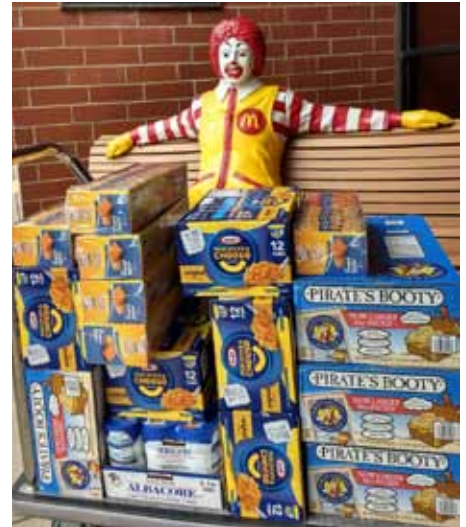
A most welcome donation from WPA.