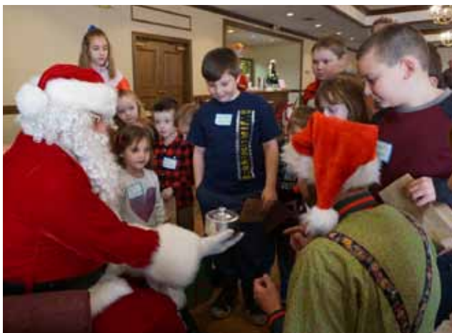
Santa (above left) assists Flower Clown with his magic show during the Branch 14 Christmas party, while one young party guest wears his balloon Santa hat and beard (above right).