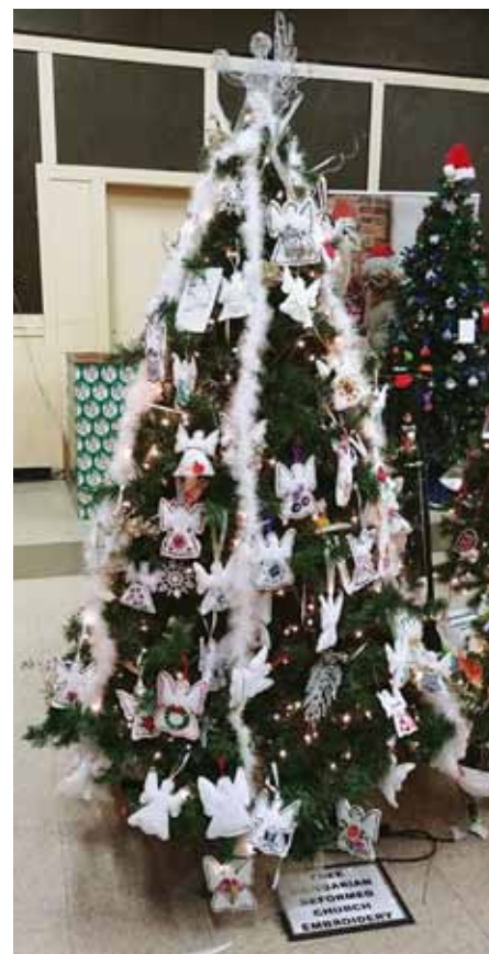
Members of Branch 226 were among the students of the Hungarian embroidery class at the Free Hungarian Reformed Church of McKeesport who decorated this tree.