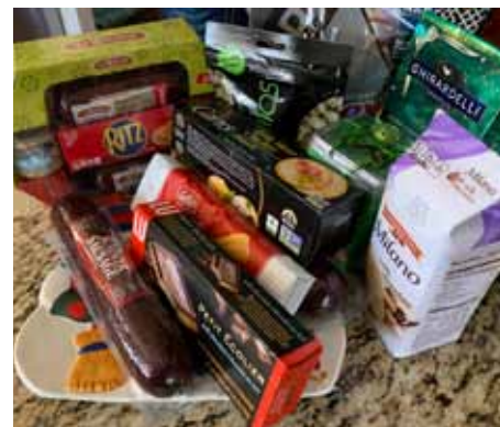
Pictured above is some of the food donated by members of Branch 15 as part of WPA's Holiday Basket program.