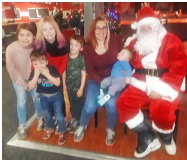
The Jolly Old Elf also shared the holiday spirit with young members of Branch 89 during the branch's family Christmas party.

We still have authentic kolbász and hot sausage for sale, and yes, we will