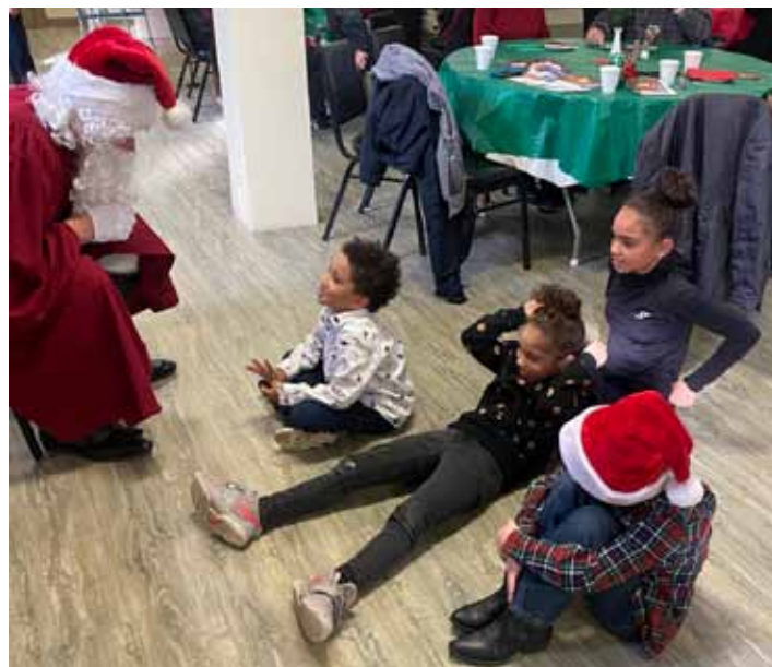
Adult members of Branch 1 Bridgeport, Conn., (above) enjoy food and conversation during the branch's annual family Christmas party Dec. 8, while the branch's young members spend time with Santa (right).