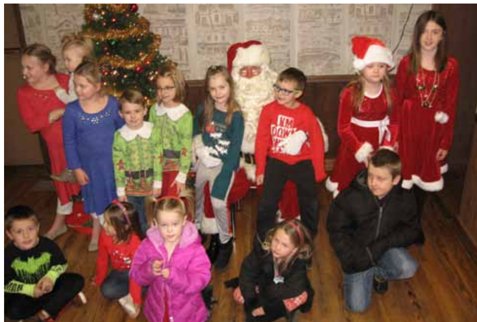
Santa welcomes young members of Branch 88 to the branch's annual family Christmas party.

It saddens us to announce the sudden and unexpected death of