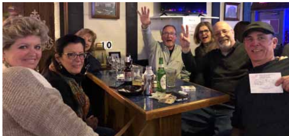
Members and friends of Branch 336 welcome the year 2020 during a New Year's Eve celebration held at the Verhovay Home Association in Harrisburg, Pa.

However, in a review of all things WPA, last year our activities were many and full of excitement and