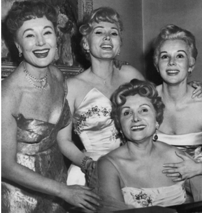
The original Kardashians: Magda, Zsa Zsa and Eva with mother Jolie.

POW camps in Hungary, sowing the seeds of a humanitarian activist.