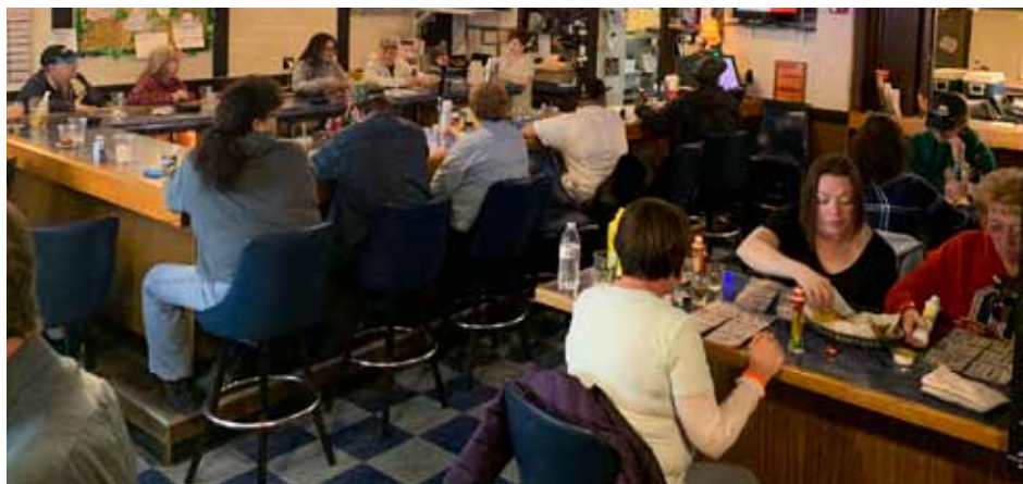
Branch 336 members and friends play bingo on Sundays at the Verhovay Home Association.

William Penn Association was represented at the 11th Annual Festival of Nations in Weirton, W.Va., on March 16. It was a day of "Unity in Diversity" for all nations attending the event. The Ohio Valley Folklanders, a dance group from the Oglebay Institute led by Cleveland-based