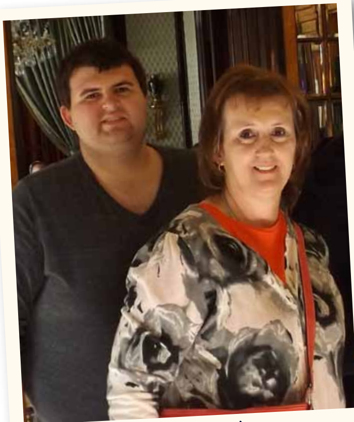
With Mom in Hungary