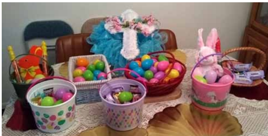
Members of Branch 26 helped out the Easter Bunny this year by preparing and delivering these baskets to special needs children in their community.