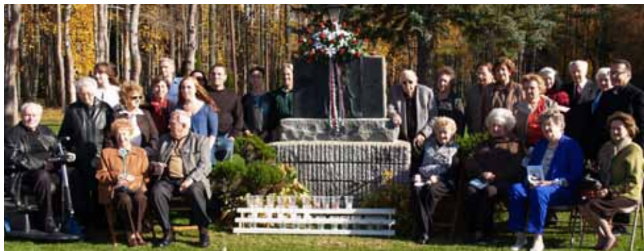
Hungarian-Americans of Youngstown, Ohio, including members of WPA Branch 28, gathered Oct. 25 to commemorate the anniversary of the 1956 Hungarian Revolution.

The branch wishes all our fellow WPA members a happy and healthy holiday season!