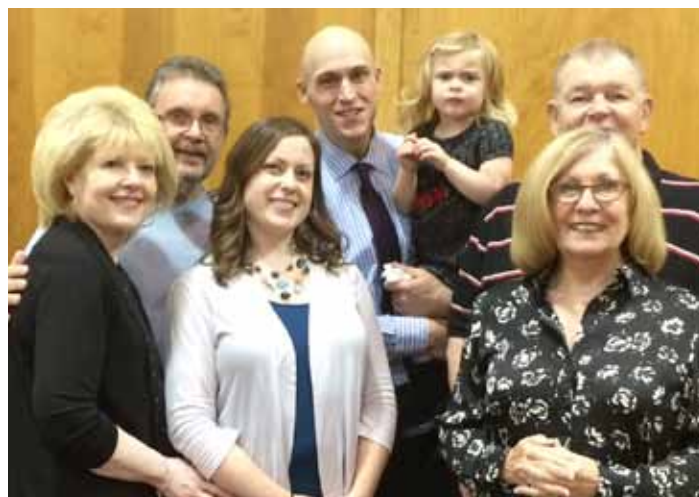
Members of Branch 34 recently attended the Howard Hanna Children's Hospital Free Care fundraising event in Pittsburgh.