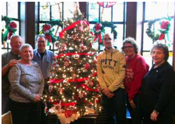
Branch 28 members help decorate the Hungarian Classroom at the University of Pittsburgh.