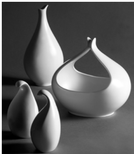
Pieces from Zeisel's "Classic Century" line

Eva Zeisel's career in design continued to develop in the United States where she designed pieces for major