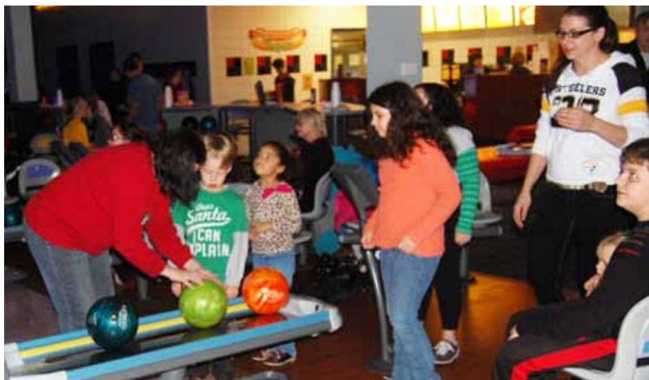
Young members of Branch 89 enjoy bowling during the branch's annual family Christmas party held Dec. 7 at Brunswick Playmor Bowling Lanes.

Branch 89 continues to collect codes from Coke products. These codes will be turned into points which can then be redeemed for