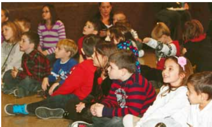
Young members of Branch 18 enjoy the entertainment provided during the branch's annual family Christmas party.