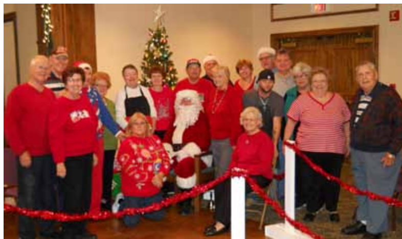
Members of Branch 14 Cleveland welcome Santa Claus to the branch's annual family Christmas party held Nov. 23

Branch 10 Barton, OH Branch 40 Martins Ferry, OH Branch 248 Monaville, WV Branch 349 Weirton, WV Branch 8164 Steubenville, OH