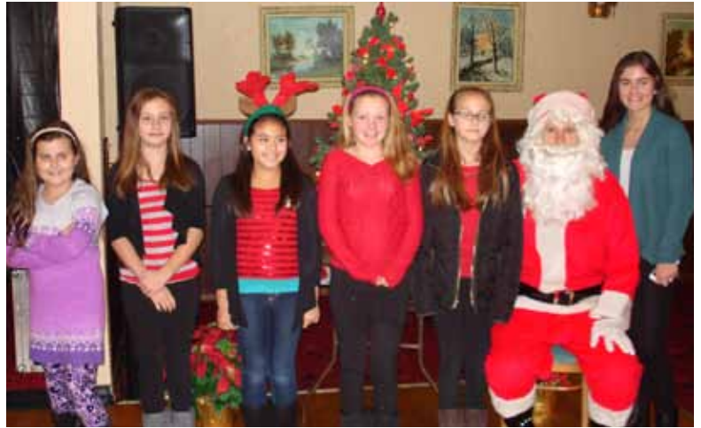
Young members welcome Santa Claus to the Branch 51 family Christmas party held Dec. 1 at the American-Hungarian Club in Garfield, N.J.