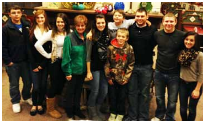
The members of Branch 26 gathered at King's Restaurant for the branch's annual family Christmas party.

you will help again next time. Thank you to all those who worked before, during and after the party. Thank you, also, to all who attended. Your support keeps us going. See you all next time.