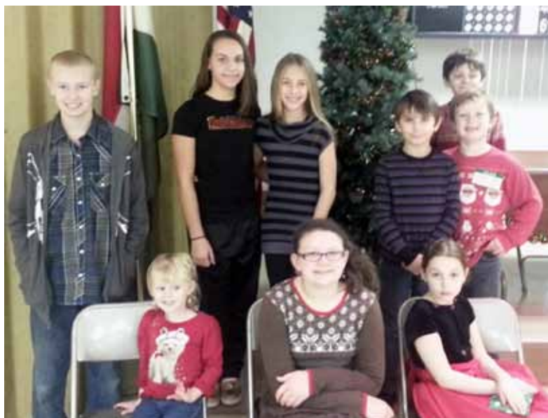
Young members of Branch 226 McKeesport, Pa., gather for a group photo during the branch's annual Christmas party.