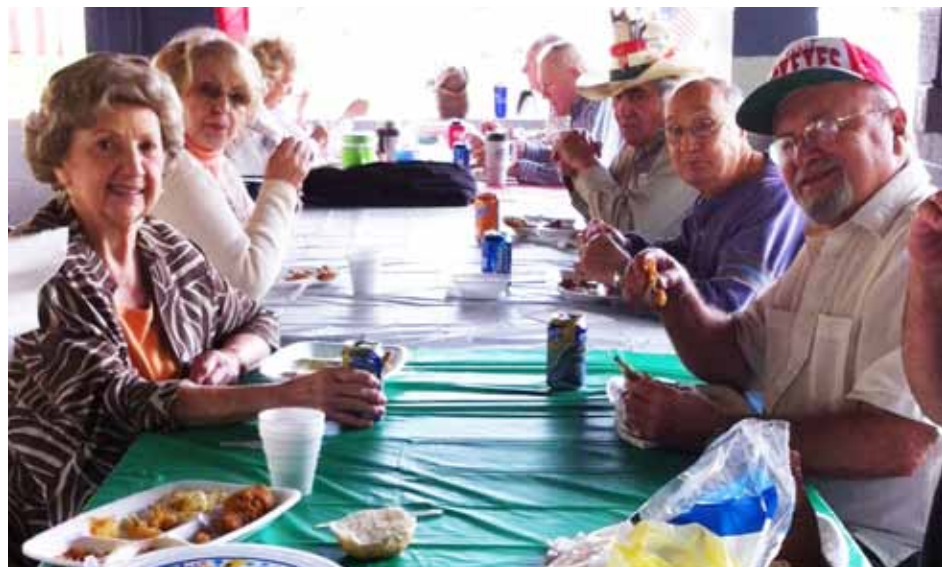
Members of Branches 10, 40, 248, 349 and 8164 join members of the Ohio Valley Hungarian American Cultural Society for a picnic and bacon fry Sept. 15 at Warren Township Park.

After a short break during the summer, we resumed our meetings on Sept. 16. We discussed our Christmas party and the Holiday