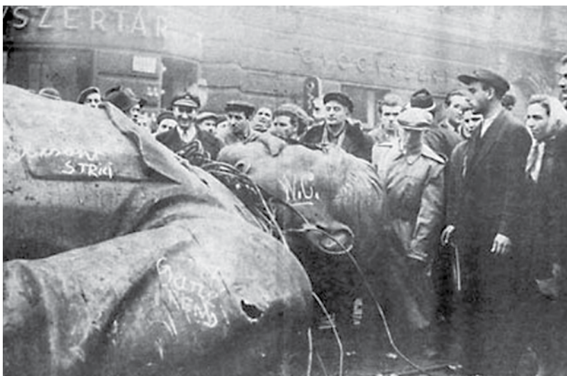
Hungarians view the toppled statue of Joseph Stalin, October 1956.