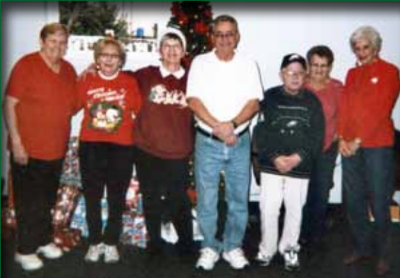
Branch 336 celebrated the Holiday season with a Christmas party Dec. 9. Above, children enjoy the balloon animals made for them by the Zembo Clowns, who performed at the party. The children also received gifts from Santa Claus. Everyone enjoyed the delicious food provided by the Verhovay Home Association. Many thanks go to the branch officers and other volunteers (pictured left) who helped make the party a big success.