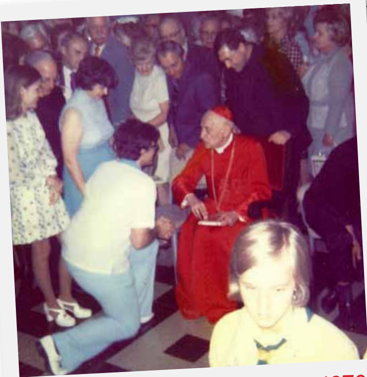
Dad meets Cardinal Mindszenty 1972

By the way, she fulfilled my request by preparing the Mák Koch (Poppy Seed Soufflé) recipe found on page 208 of A Taste of Hungarian Heaven , the most recent WPA cookbook printed in 2006.