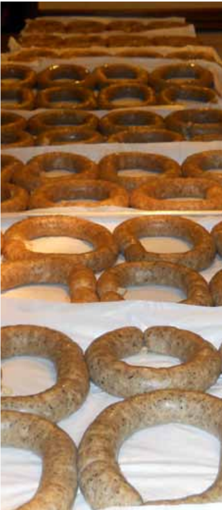
Some 165 pounds of hurka was made with the help of Branch 14 members. They also made 240 pounds of kolbász.