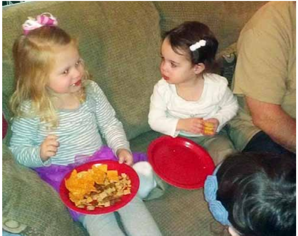
Two young guests enjoy some food and each other's company during a family Christmas party hosted by Branch 400 this past holiday season.

It's also the time that many of WPA's fraternal activities will begin. The bowling tournament on May 4 will be here soon. This promises to be a fun, fraternal event--one you won't want to miss. Everyone who attended last year's tournament had a great time. The Meadows Race-track & Casino will be celebrating the Kentucky Derby that weekend, so many things are planned by the Casino that our guests will be able to participate in. You can find information on the tournament elsewhere in