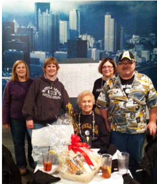
Members of Branch 89 enjoy the branch's first-ever Steeler party at Dave & Buster's on Nov. 3.

Branch 89 is busily preparing for our annual family Christmas party, which will be held at the Brunswick Playmor Bowl on Dec. 7 at 1:00 p.m. It will be cosmic bowling. Yes, there will be bumpers on the lanes, and we will serve pizza and soft drinks. Reservations can be made by calling the branch coordinator at 412-872-5022. We hear that Santa Claus will pay us a visit. Seems Santa likes