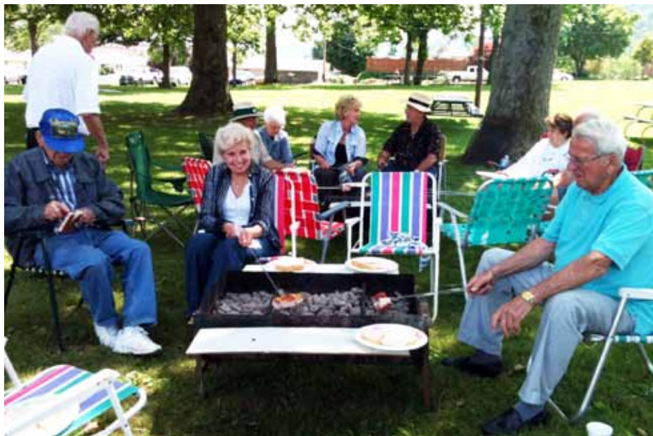
Guests enjoy a bacon roast June 3 during a picnic hosted jointly by WPA Branches 10, 40, 248, 349 and 8164 and the Ohio Valley Hungarian American Cultural Society.

Also, mark your calendars for the OV Hungarian American Cultural Society Dinner-Dance on Aug. 25. It will be at the Yorkville VFW with a social at 5:30 p.m. followed by the Oglebay dancers, dinner by Miller Catering and music by "The Hungarians." Reservations and money must be in by Aug. 16. Members are $12 and guests $15. Send your RSVP to OVHACS, P.O. Box 505, Martins Ferry, OH 43935. You can always call me for more information.