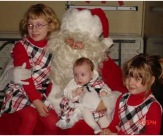
ABOVE: Young guests welcome Santa to a party hosted by Branches 34, 71 and 352. RIGHT: Young members share a moment at Branch 88's party.