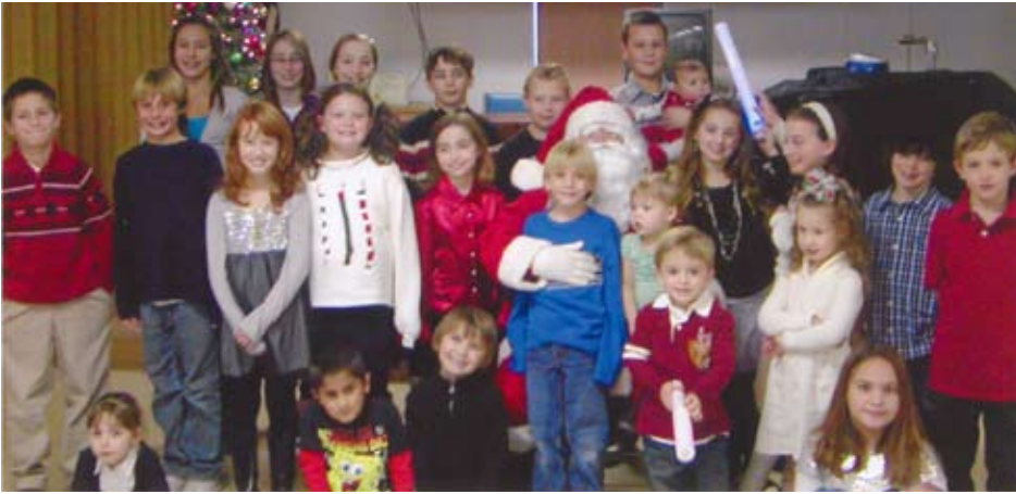
The children of Branch 226 enjoyed a visit from Santa during the branch's Christmas party.

by all who attended. We requested that attendees bring nonperishable food items to be distributed to a food bank. A total of 83 food items totaling 111 pounds was collected. This year, the food was delivered to the Northside Common Ministries Food Pantry on Brighton Road, just a few blocks from the Home Office. This ministry is a non-profit, community based organization established in 1982 to meet the increasing needs of the homeless population. It operates an emergency shelter for men, the food pantry and a permanent housing program for men with disabilities. The need is great, so our donations will be put to good use. Many thanks to those who brought food donations to the party.