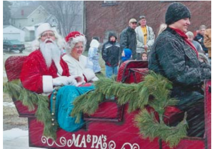
Santa and Mrs. Claus traveled by horse-drawn sleigh to attend the family Christmas party hosted by Branch 189.