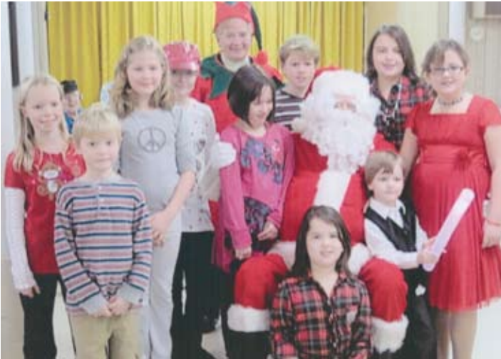
Members of Branch 89 welcome Santa to the branch's annual family Christmas party at Brunswick Playmor Bowling Lanes.