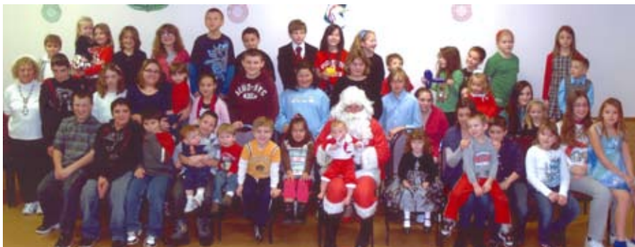
ABOVE: The children of Branch 28 gather around Santa during the branch's annual family Christmas party. RIGHT: Santa also visited a party hosted jointly by Branches 34, 71 and 352 where he listens to the children's Christmas wishes.